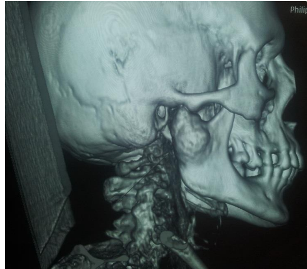
Figure 2. MSCT of the head and neck: an expansive tumor formation in the lower jaw

lowed by hemimandibulectomy with disarticulation of the TMJ (temporomandibular joint), tumor extirpation in the infratemporal fossa, excision of the tumor in the preauricular region, with an adequate reconstruction of the created soft tissue defect with a cervicofacial flap. The post-operative course was uneventful, and the patient was released from the clinic on the tenth postoperative day.